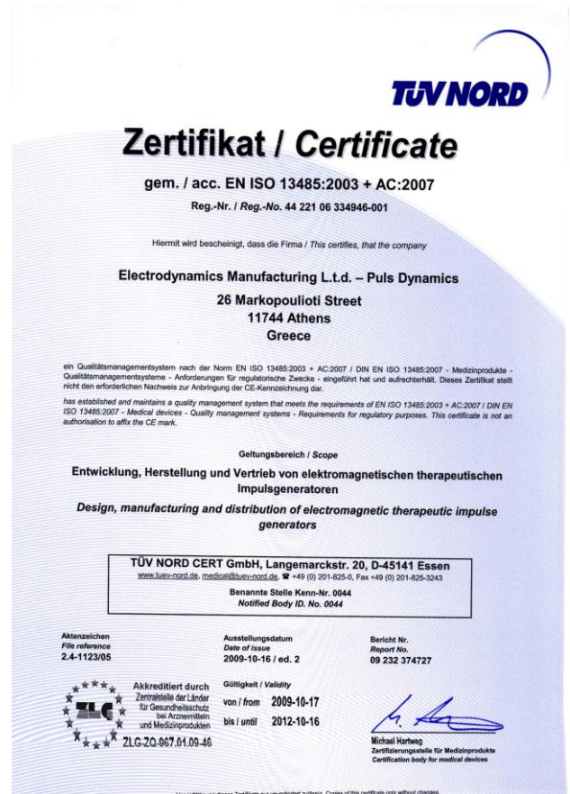
Certificate of ISO 13485:2003