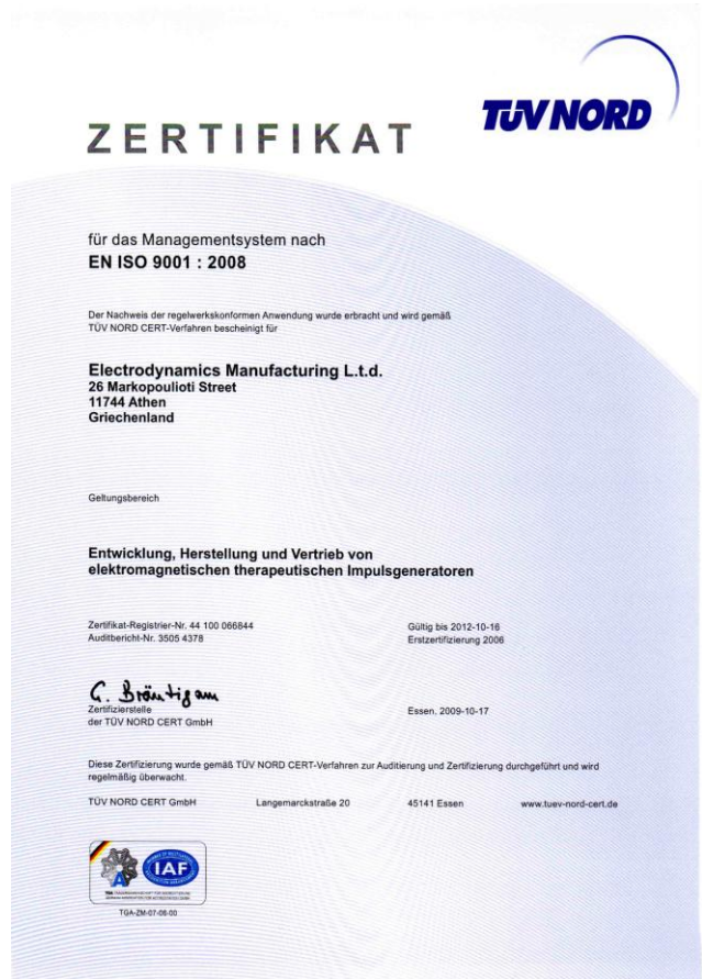
Certificate of ISO 9001:2008