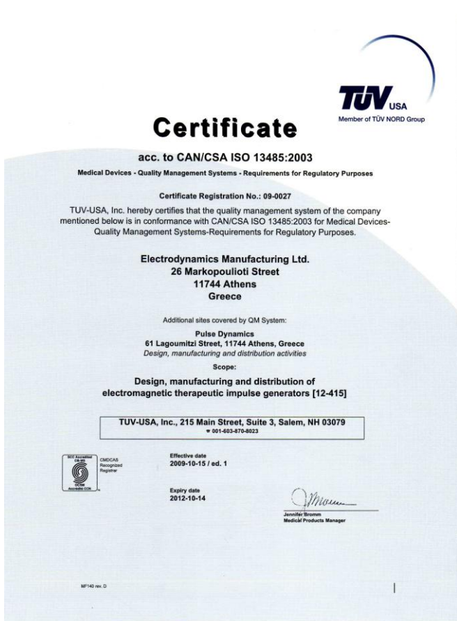
Certificate of CAN/CSA ISO 13485:2003