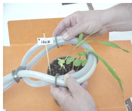
Exposing plants and seeds with the PAPIMI™ device.