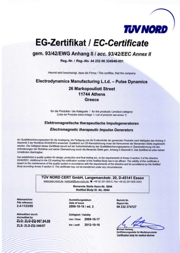
Certificate of Directive 93/42 EEC - CE 0044 -