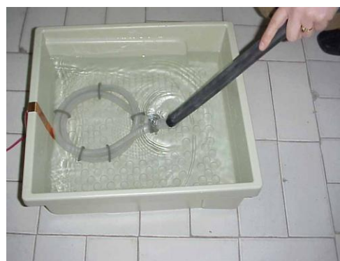
Treating water with the PAPIMI™ device.